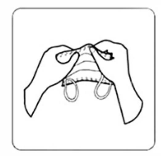
Flatten the mask, and simply bend the nose bar to fit the face shape.