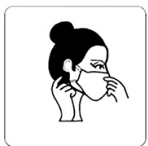
Pull elastic earloops over ears, and extend mask to fully cover mouth, nose and chin.